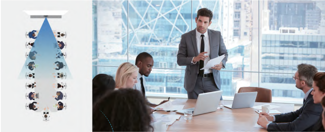
12x optical zoom