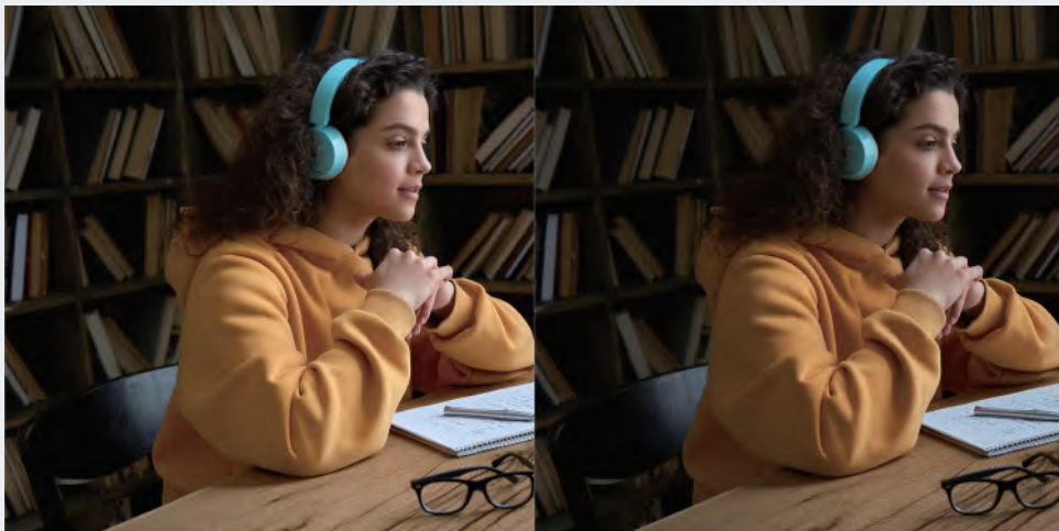
After 2D &amp; 3D DNR