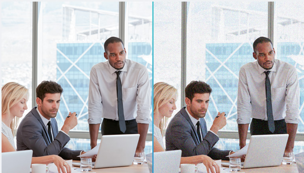
After 2D & 3D DNR